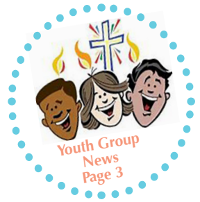
Youth Group News Page 3