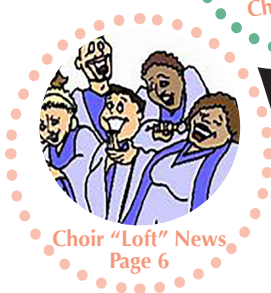
Choir "Loft" News Page 6