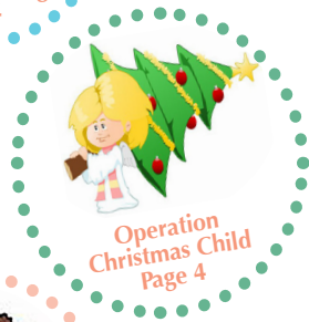
Operation Christmas Child Page 4