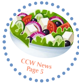
CCW News Page 5