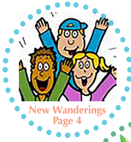
New Wanderings Page 4