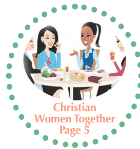
Christian Women Together Page 5