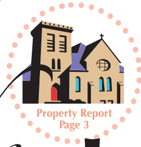
Property Report Page 3